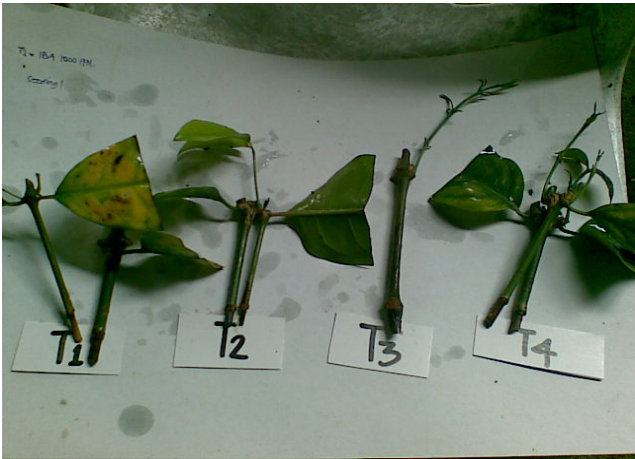
Fig. 2. Representative samples of rooted bago cuttings.