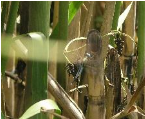
Fig. 8. Acisoma panorpides Rambur, 1842