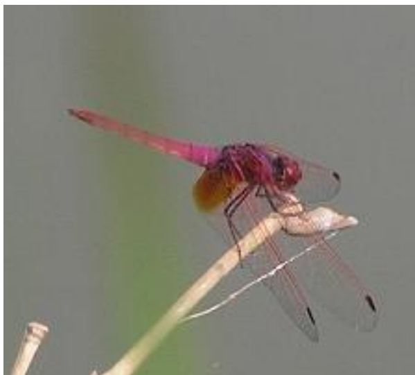
Fig. 6. Trithemis aurora Burmeister, 1839