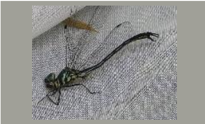
Fig. 3. Idionyx philippa