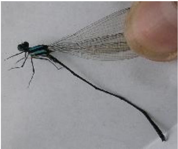
Fig. 9. Prodasineura integra Selys, 1882