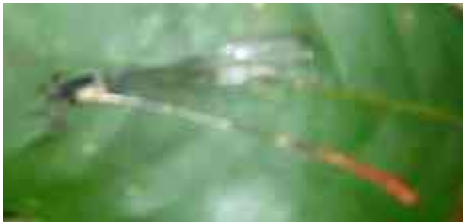
Fig. 5. Risicnemis erythrura