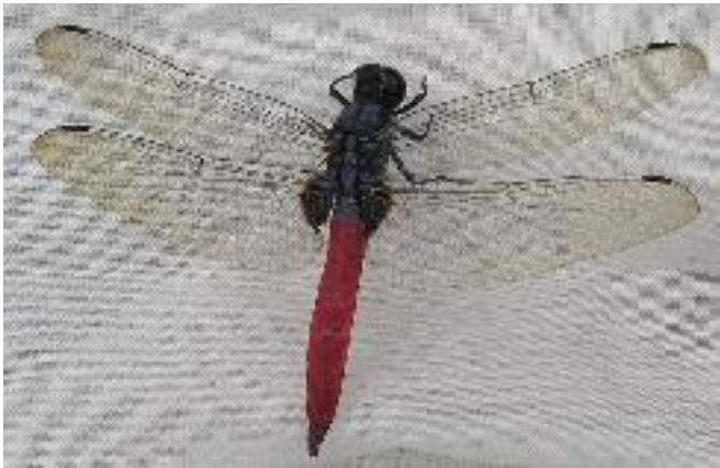
Fig. 4. Orthetrum pruinatum clelia