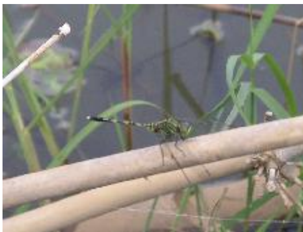
Fig. 7. Orthtrum sabina sabina Brauer, 1773